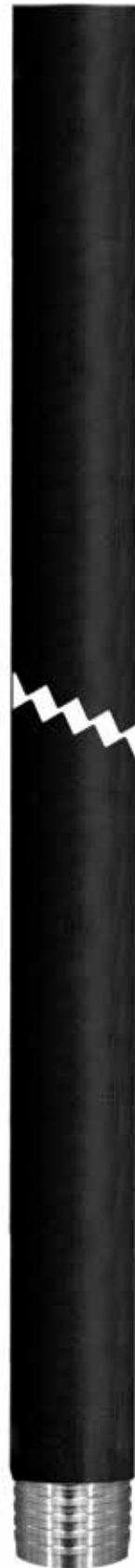
Wireline drill rod