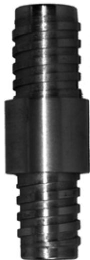
Drill rod coupling